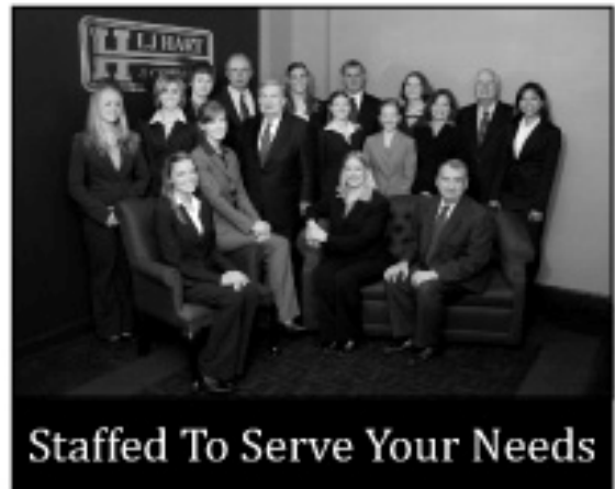
Staffed To Serve Your Needs