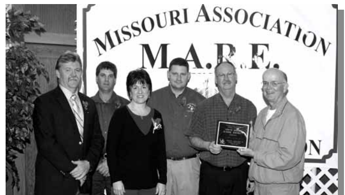
Rural School District North Shelby School District